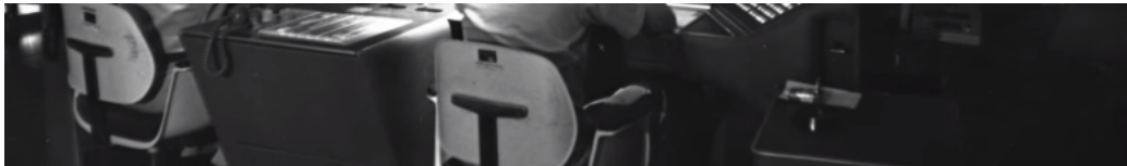
NORAD's predecessor CONAD in 1955.

Business Markets Tech Media Personal Finance Small Biz Luxury stock tickers