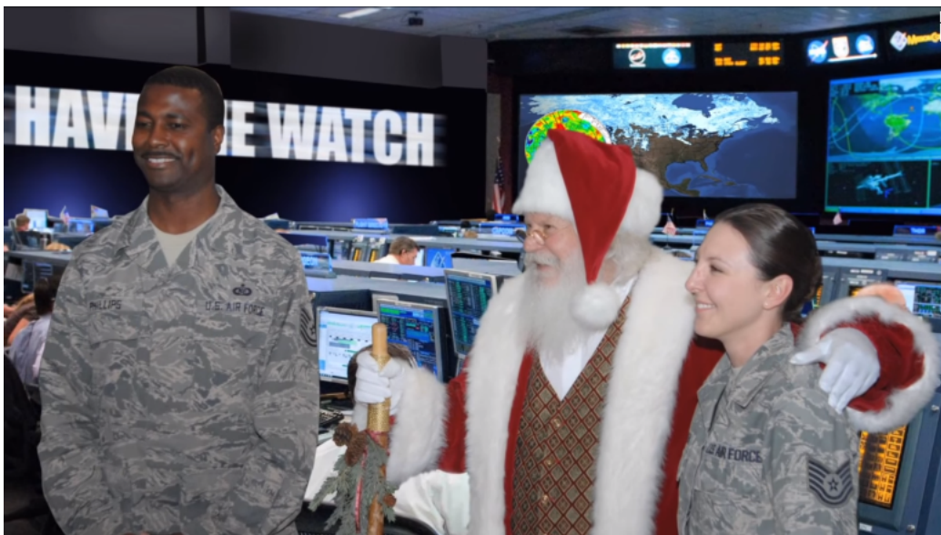
CNNMoney (New York) First published December 24, 2015: 10:56 AM ET