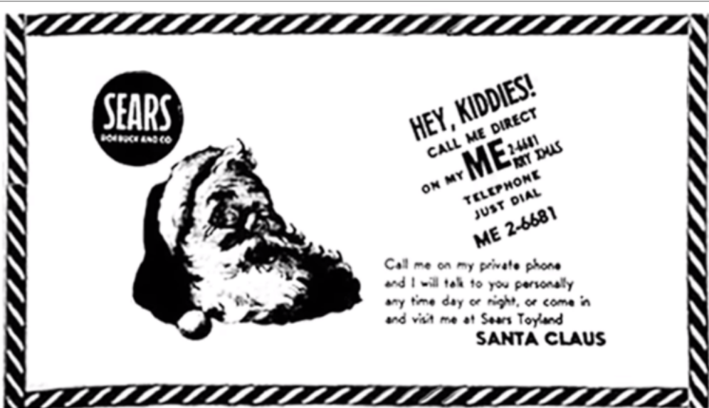
The 1955 Sears ad that started NORAD's Santa tracker.

Sometimes a simple typo can lead to a Christmas miracle.