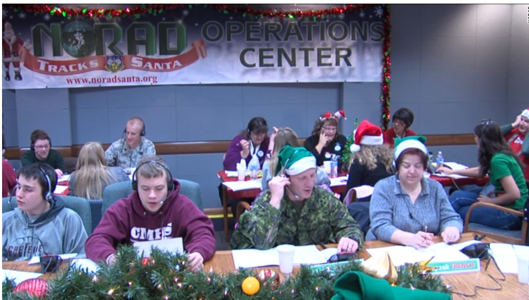
Volunteers take calls from children looking for Santa's whereabouts.