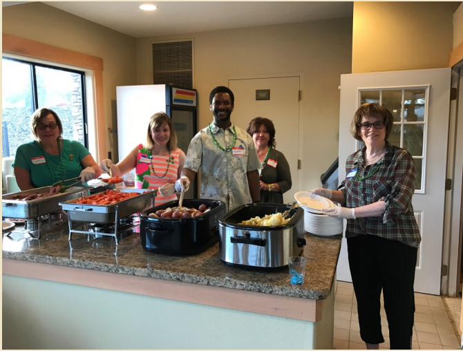
St Pats Dinner "ArrowCreek Chef's at St Patrick's Day dinner 3/17/17